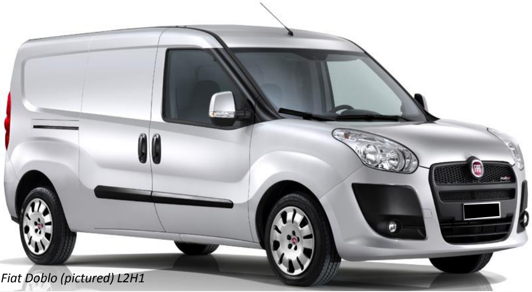
Opel Combo or Fiat Doblo (pictured) L2H1

A professional appearance is crucial when delivering high quality services. The Reduct customized inspection vehicle is fitted with a bespoke Sortimo® interior that is specifically designed to safely and efficiently store the standard Reduct pipeline mapping equipment and accessories. In addition, ample storage space is available for additional accessories, equipment and tools you may wish to carry with you. Contact us for a detailed offer.